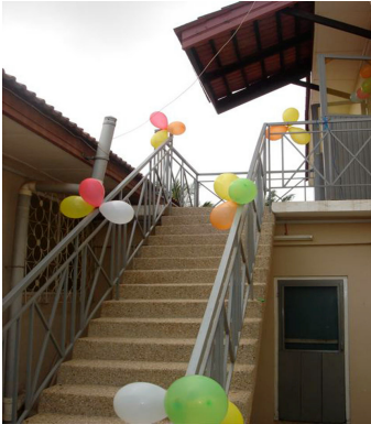
Festive entrance to lab