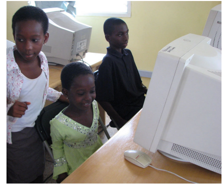
Clearly happy with the new room

The opening was a great event, refreshments were served and a small book and toy raffle was held for the children.