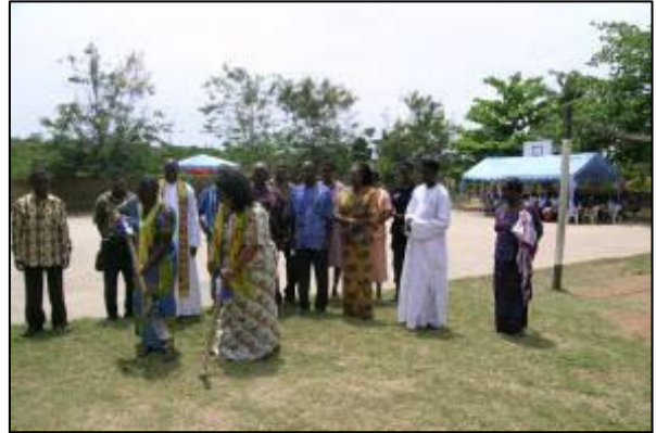
Sod cutting – Cape Coast 2 nd ERC