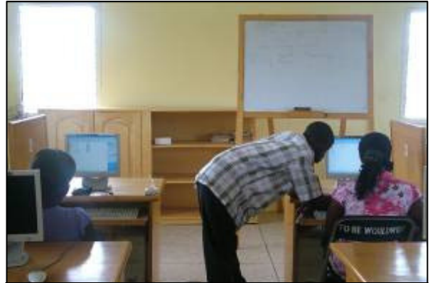
Prince teaching one of the teachers