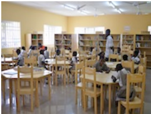
Library at Cape Coast Centre