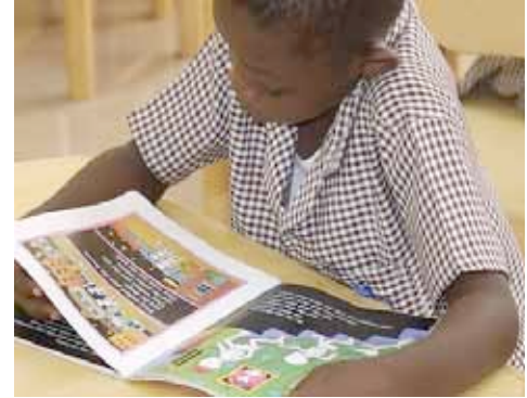
Simply wonderful to watch