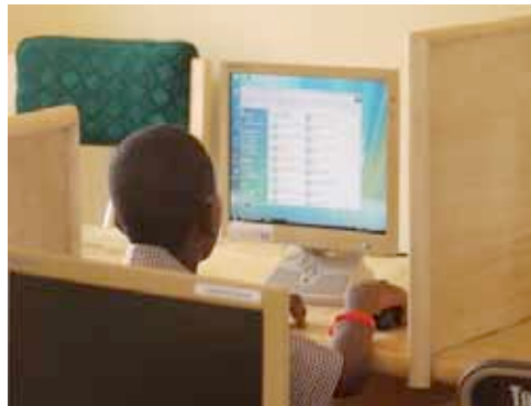
ICT classes taking of in Cape Coast