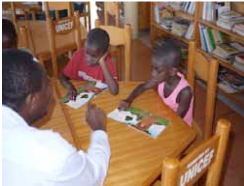
a reading class at Takoradi Centre