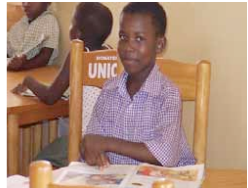
Enjoying his book